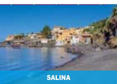
A stop at Santa Marina Salina