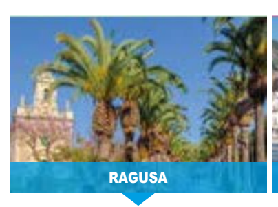
Ragusa with its baroque churches and Ibleo garden